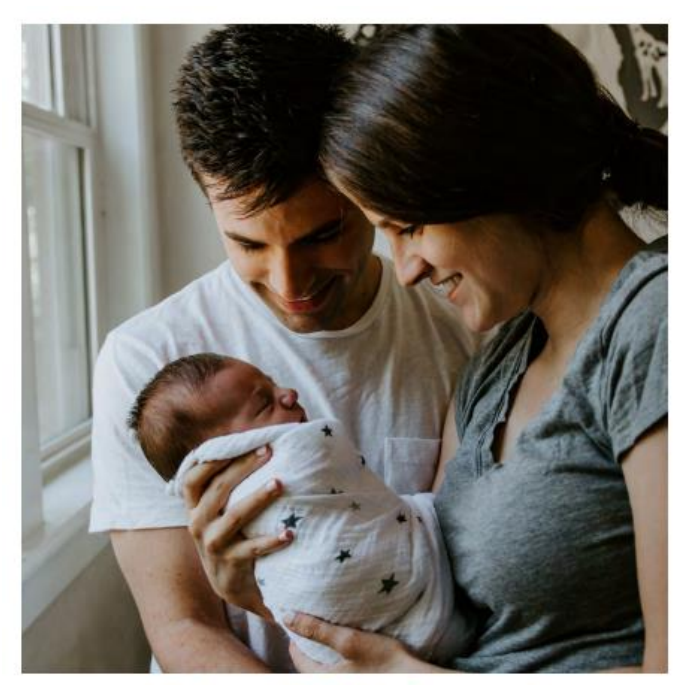
Maine Child Safety and Family Well-Being Plan